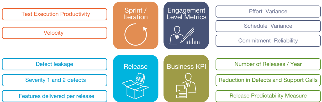
Figure 2. DevOps Quality Metrics Model